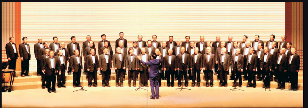
Southern California Elders Choir

All of the proceeds will go to benefit Baby Box, a non-profit organization dedicated to preventing babies from being placed in dangerous situations.