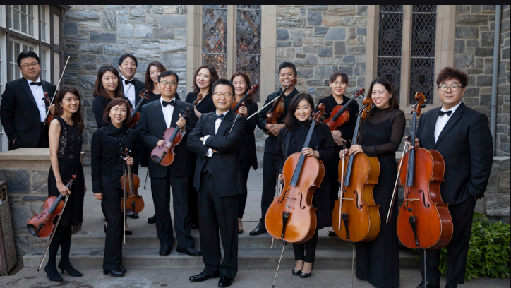
Shekinah Chamber Ensemble